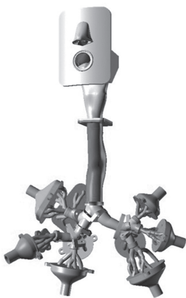
Fig. 1. Visualization of the Brno lung model – the variant of the segmented replica of airways serving for measurement of inhaled particle deposition.

The engineering approach is a problem-solving technique that can be applied not only in the aerospace or automotive industry but also to biological systems, phar-